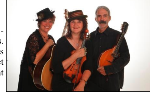
Fiddlin' Big Sue Band

The market season begins this Sunday, June 4 from 12:00-4:00 p.m. at Rolling Rock Park. Stop by, tour, and shop for fresh fruits, vegetables and crafts. Each market will also provide entertainment. The inaugural market features the Fiddlin' Big Sue Band. For more information, you can visit the Market website at <a href="www.dexterlakefarmersmarket.org">www.dexterlakefarmersmarket.org</a> or find them on Facebook at Dexter Lake Farmers' Market.