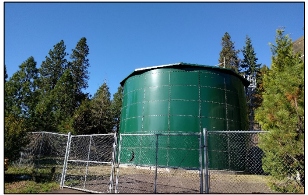
The City of Lowell maintains two above ground storage tanks with a combined capacity of just over 1,000,000 gallons.

As part of their report, the OHA noted that the Lowell water system is “well-operated and maintained by knowledgeable and competent staff”. The city’s water system survey frequency has also been reduced from every three years to every five years.