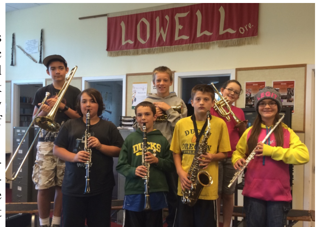
Students with instruments purchased with community donations.

Also, many thanks to everyone in supporting our current poinsettia and wreath sales. These funds help us to repair instruments, purchase new music and compete in festivals in the Spring. If your order wasn't fulfilled last year, please contact Mr. Burch at pburch@lowell.k12.or.us or 541-937-2124.