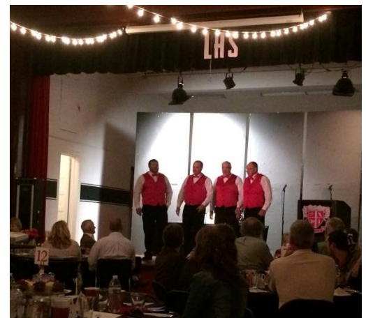
Our emcees: 4-C Sons barbershop quartet