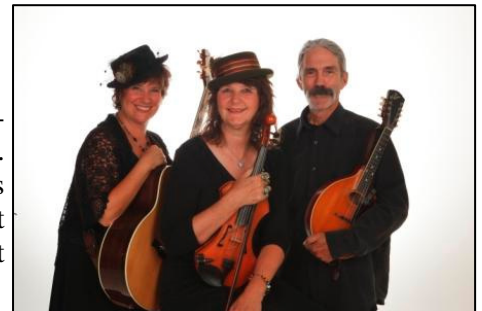
Fiddlin' Big Sue Band

The market season begins this Sunday, June 4 from 12:00-4:00 p.m. at Rolling Rock Park. Stop by, tour, and shop for fresh fruits, vegetables and crafts. Each market will also provide entertainment. The inaugural market features the Fiddlin' Big Sue Band. For more information, you can visit the Market website at www.dexterlakefarmersmarket.org or find them on Facebook at Dexter Lake Farmers' Market.