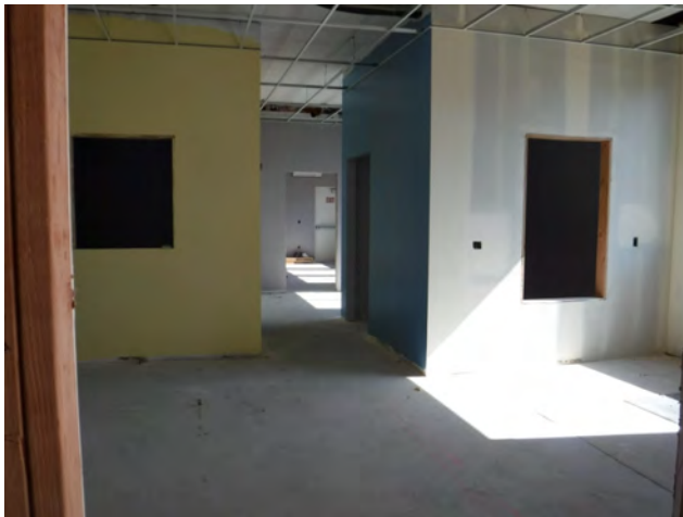
New offices at Lundy Elementary