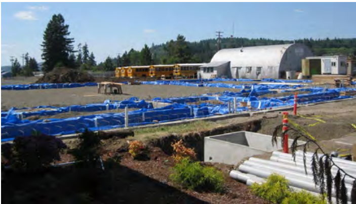
New high school gymnasium/wrestling room walls are starting to go up!