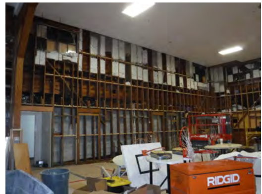
Seismic work being done in the Lundy gym.