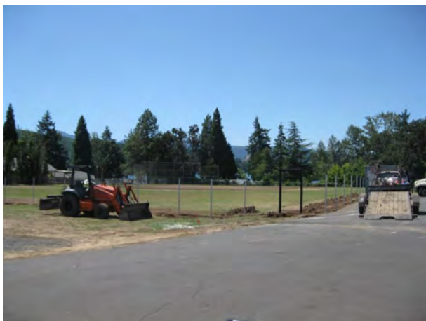
Safety fencing being installed at Lundy Elementary