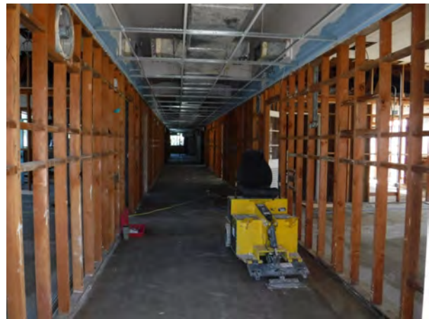
West wing taken down to the studs for remodeled Mt. View Academy classrooms