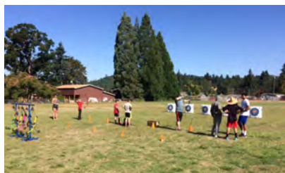
Students learning archery skills.

Participation is high again this year and the kids are enjoying the great weather and fun activities.